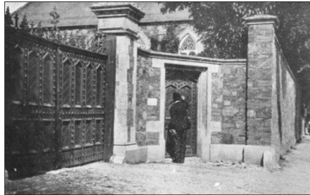
A press man fails to gain entrance to the Agapemone.