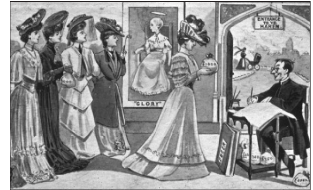
Fleet Street satirical postcard – queuing for the vicar's harem.